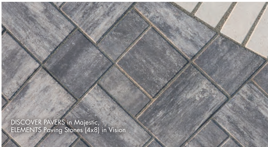
DISCOVER PAVERS in Majestic, ELEMENTS Paving Stones (4x8) in Vision