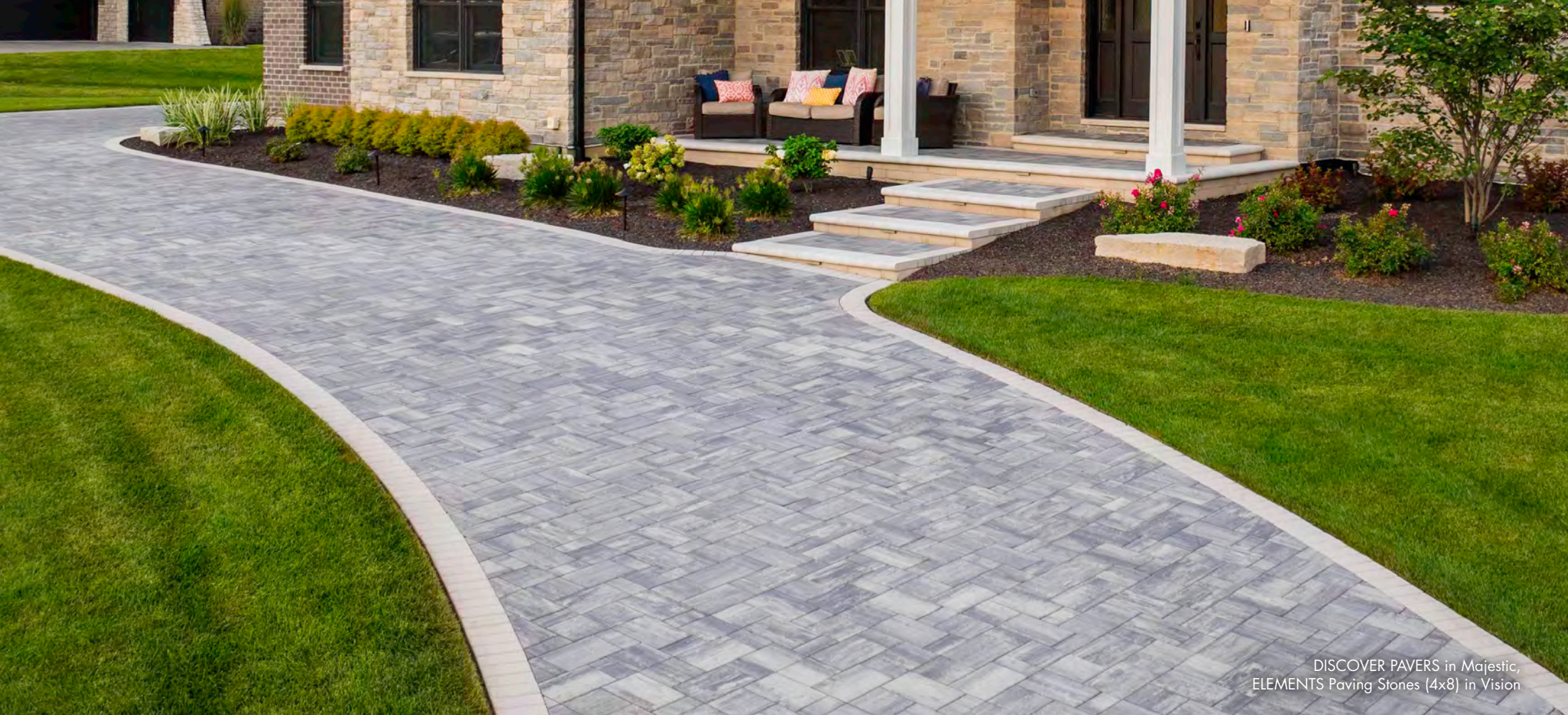
DISCOVER PAVERS in Majestic, ELEMENTS Paving Stones (4x8) in Vision