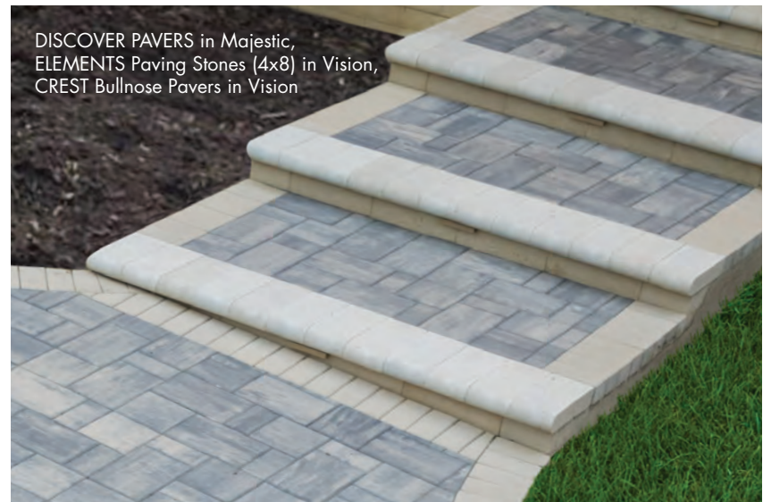
DISCOVER PAVERS in Majestic, ELEMENTS Paving Stones (4x8) in Vision, CREST Bullnose Pavers in Vision