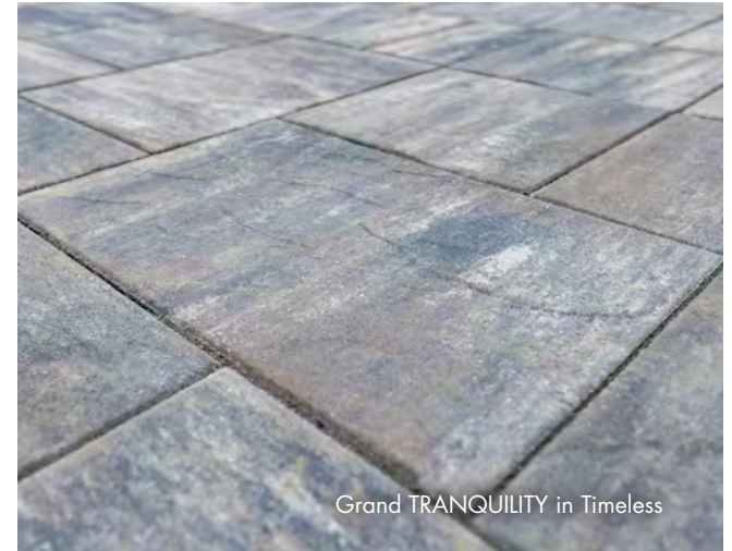
Grand TRANQUILITY in Timeless