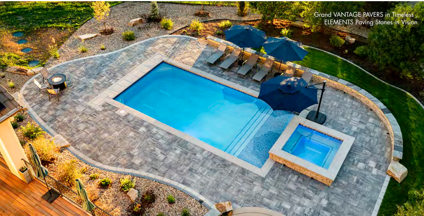
Grand VANTAGE PAVERS in Timeless ELEMENTS Paving Stones in Vision