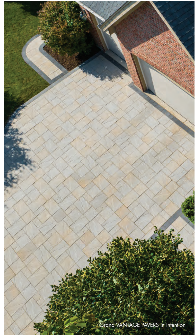
Grand VANTAGE PAVERS in Intention

Aspect Ratio Disclaimer: County Materials unit "slab(s)" do not meet aspect ratio for vehicular application, as defined by CMHA standards. It is the responsibility and discretion of Buyer, Owner, Contractor, Architect, or Engineer to determine whether these unit "slab(s)" are suitable for the specific project. County Materials recommends consulting with a qualified professional to assess the suitability for the project. County Materials Corporation accepts no responsibility or liability for the use of unit "slab(s)" in a vehicular application.