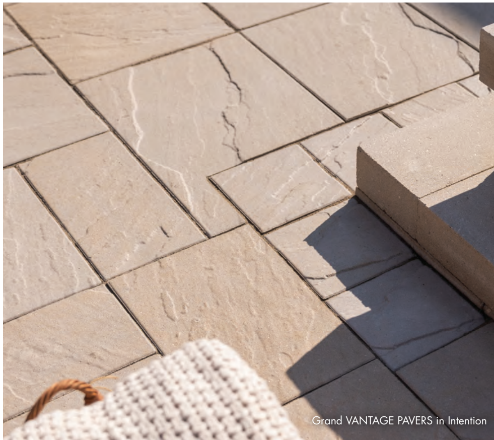
Grand VANTAGE PAVERS in Intention