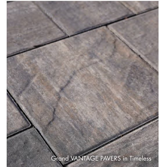
Grand VANTAGE PAVERS in Timeless