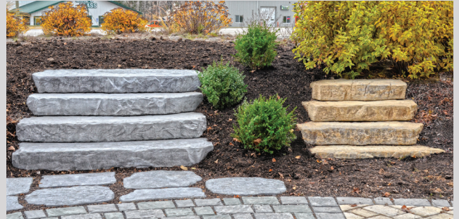
LARGE 6' IRREGULAR STEP COMPARED TO STANDARD IRREGULAR STEP SET